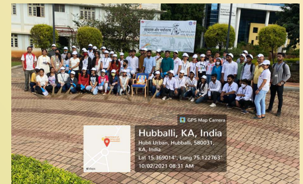
The faculty and students gathered to pay tributes to Mahatma Gandhi on his birth anniversary