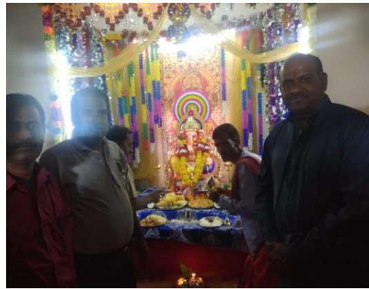
Ganesh Chaturthi celebration