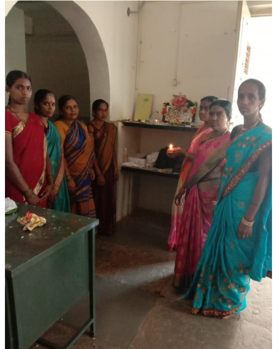
Diwali and Dasara celebration at hostel