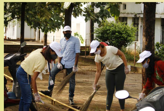
Campus Cleanliness Drive to promote Swacchata aur Paryavaran