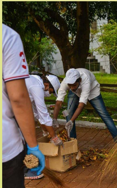
Students actively taking part in Campus Cleanliness Drive