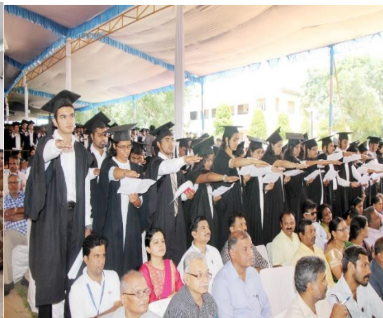
Pledge on the Graduation day