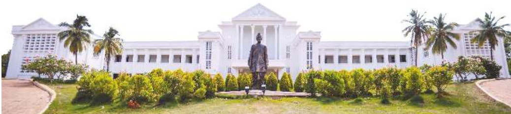
CENTRE FOR ENGINEERING EDUCATION RESEARCH