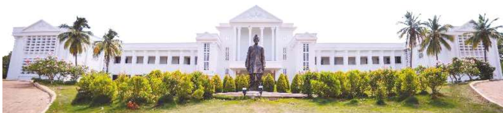
CENTRE FOR ENGINEERING EDUCATION RESEARCH