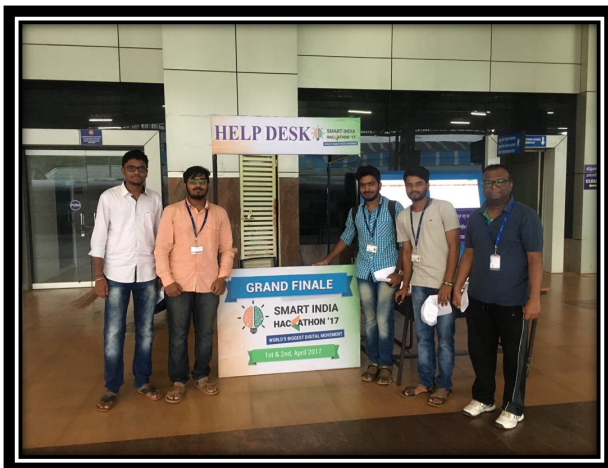
Help Desk at Railway Station