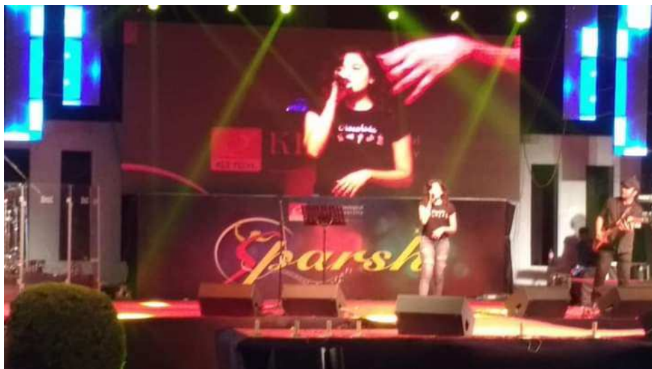
Bollywood night performed by Shirley Setia at Quadrangle, KLE Technological University.