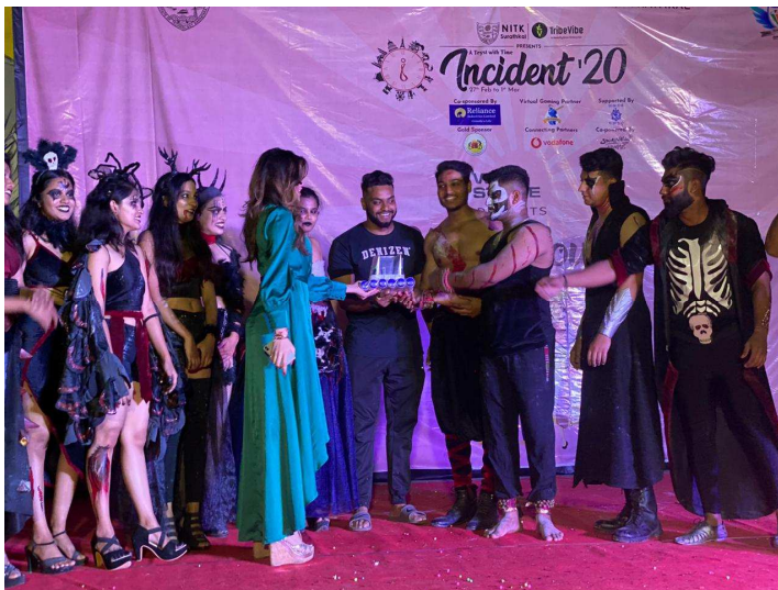
KLE Tech University Fashion Team conquered first place in Haute Couture .